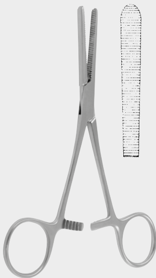
cm WEISS (Klinikum Berlin) 14,5 12-7002-14 16,0 12-7002-16