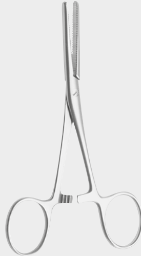
cm PEAN 12,0 12-7000-12

Tubing Clamps Pincas serre-tube Pinzas cierra-tubo Pinze serratubi