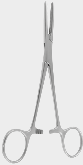
MURPHY (VORSE) SCHÖNBERG 12-7100-15 - 12-7100-20